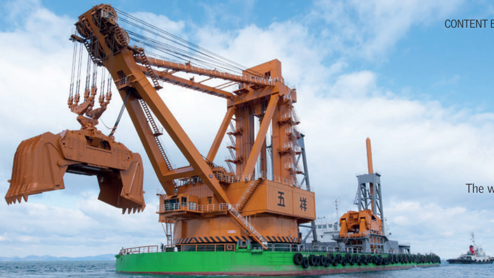
The world's largest grab dredger "Gosho"